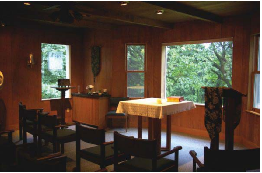
small and simple The Ark and the Dove Retreat House Chapel near Pittsburgh, PA - where the Catholic Charismatic Renewal had its first visible manifestation back in 1967.

chapel to celebrate Mass, I was leave you, Lord. You are worthy."