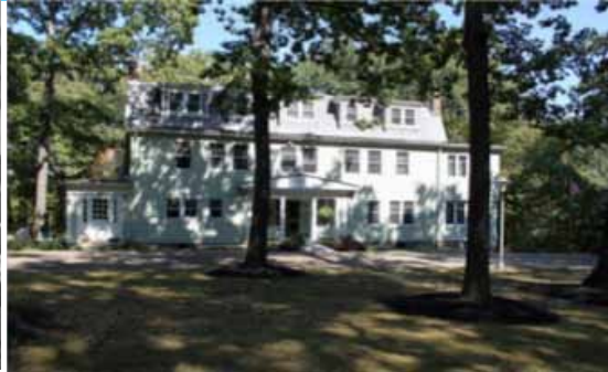
The Ark and The Dove, Inc. Home of Baptism in the Holy Spirit