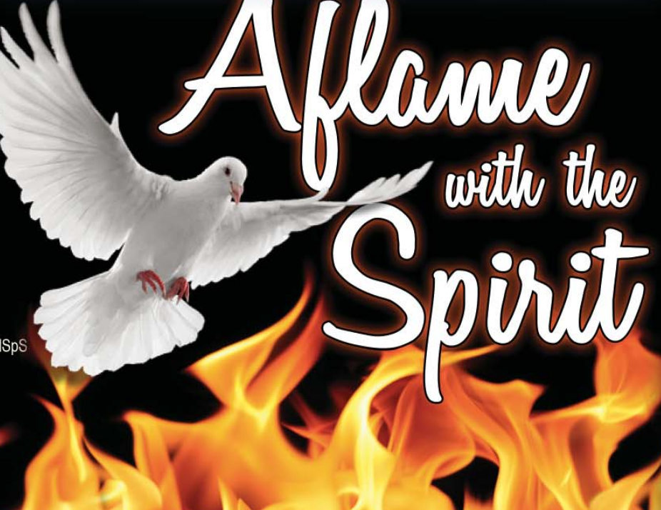
Labor Day Weekend 3, 2017 September