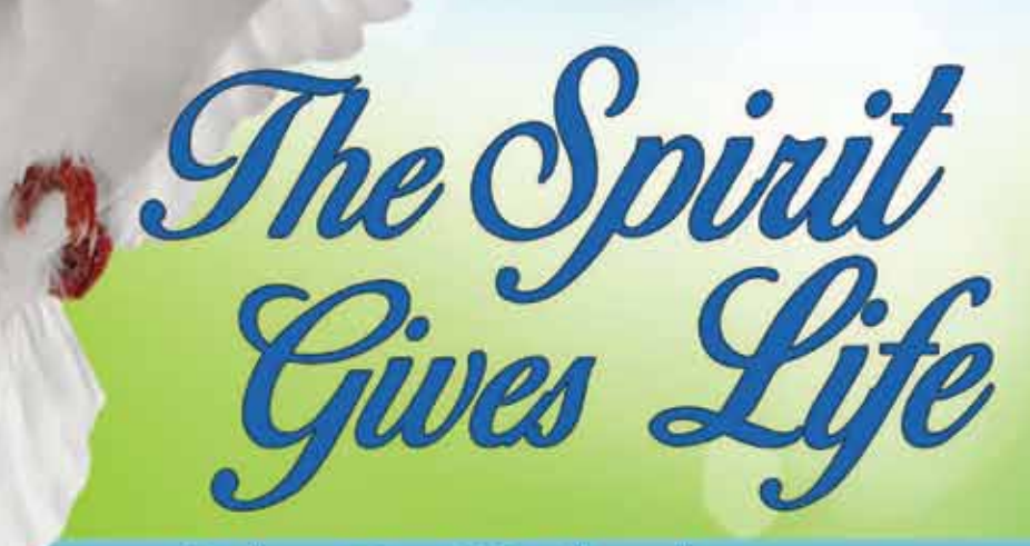
Labor Day Weekend August 31-September 2, 2018 Anaheim Convention Center & Arena