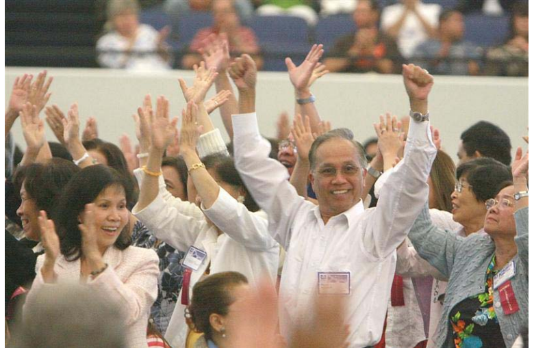
Above Right: SCRC was happy to host the Vietnamese Conference with attendees from around the United States & beyond!