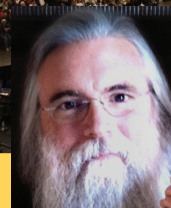
John Michael Talbot