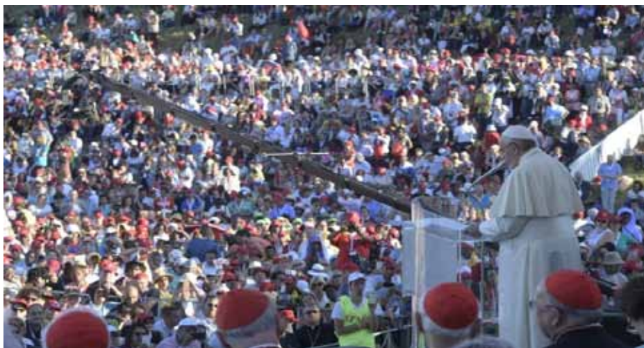
Golden Jubilee continued from cover page brother. Reconciled diversity.

Now we are here and we are many! We have gathered to pray together, to ask the Holy Spirit to come upon each of us, so that we can go forth into the streets of the city and the world to proclaim the lordship of Jesus Christ.