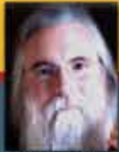
John Michael Talbot Brothers and Sisters of Charity Berryville, AR

will include the "Unbound" model...a peaceful, non-confrontational approach to deliverance currently gaining worldwide recognition!