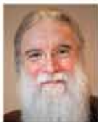
John Michael Talbot Singer-Songwriter, Author, Speaker, Founder & General Minister for the Brothers & Sisters of Charity Diocese of Little Rock, AR