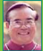
Bishop Dominic Luong Diocese of Orange