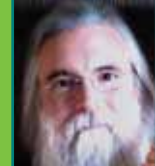
John Michael Talbot Berryville, AR