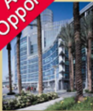
Anaheim Convention Center & Arena Anaheim, CA

The SCRC Catholic Renewal Convention is featuring an addition of Two Separate Tracks presented by World-Renowned Experts in Exorcism & Deliverance Ministry