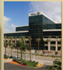
Anaheim Hilton Hotel Directly adjacent to the Anaheim Convention Center

These tracks are held in conjunction with the 41st Annual SCRC Catholic Renewal Convention, "God of Power and Might!"