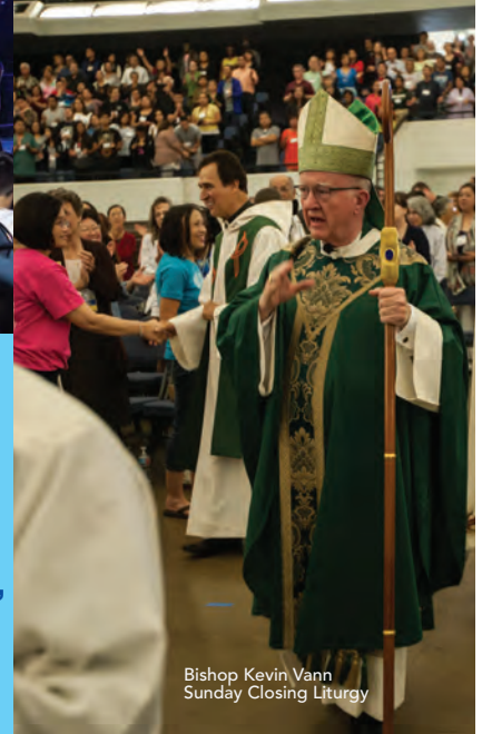
Bishop Kevin Vann Sunday Closing Liturgy

SCRC Catholic Renewal Convention "Rejoice and Be Glad" September 4-6, 2015 Anaheim Convention Center