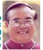
Bishop Dominic Luong Orange Diocese