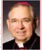
Archbishop Jose Gomez Archdiocese of Los Angeles