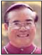
Bishop Dominic Luong Orange Diocese