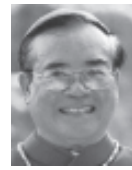
Bishop Dominic Luong Orange, CA

Labor Day Weekend September 4-6, 2009 Anaheim Convention Center