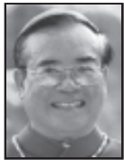
Bishop Dominc Luong Diocese of Orange